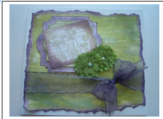
This workshop shows you how to make a card using different techniques on white card stock & ribbon.