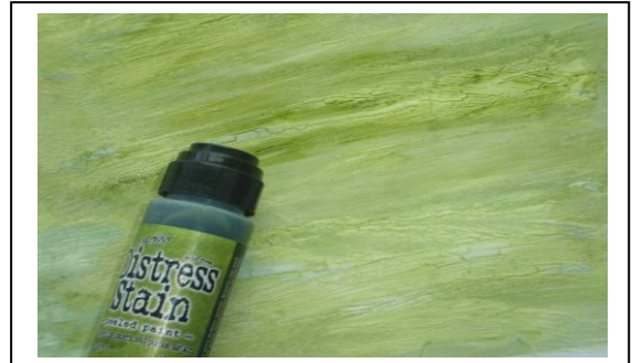
Once the paint is dry swipe the distress stain over the paint to colour in between the cracks and add colour if the lighter crackle paint have been used.