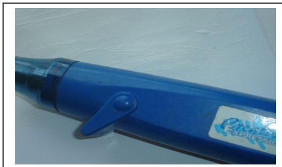
Allow the paint to dry by air or this process can be speeded up by using a heat tool.