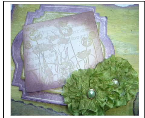
A close up of the vintage ribbon rosette flowers.