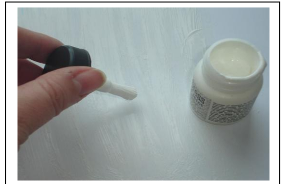
Take the crackle paint and apply a thick layer of the paint onto the card.