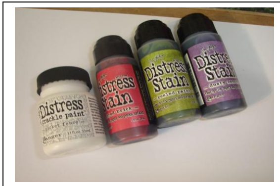
Select a piece of 240gsm card stock & decide on the colour scheme. Here the Tim Holtz dusty concorde & peeled paint distress stains along with the distress crackle paint are being used.