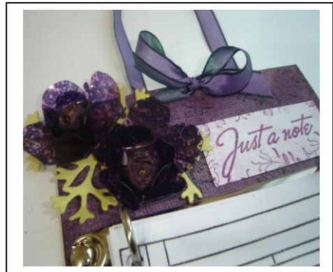
The flower embellishment is made using the studio 490 film as it adds dimension to the project.