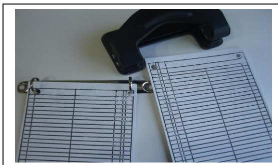
Use a standard hole punch to punch holes at the top of each sheet.