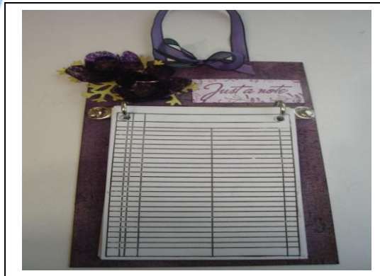
This workshop shows you how to make a notepad using some of the Tim Holtz grungeboard along with an Ideology small ring binder.

Vernon Court Henson Way Telford Way Ind. Estate Kettering Northants NN16 8PX