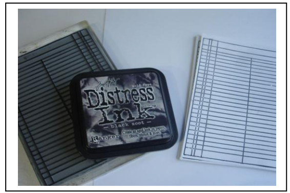
Mount the ledger stamp onto some Umount foam & place it onto an acrylic block. Ink the stamp with the black soot distress ink pad. Stamp the image onto 160gsm paper before cutting each sheet out. The distress ink gives a lovely feel to the paper but the archival black ink pad could be used for a crisper look.