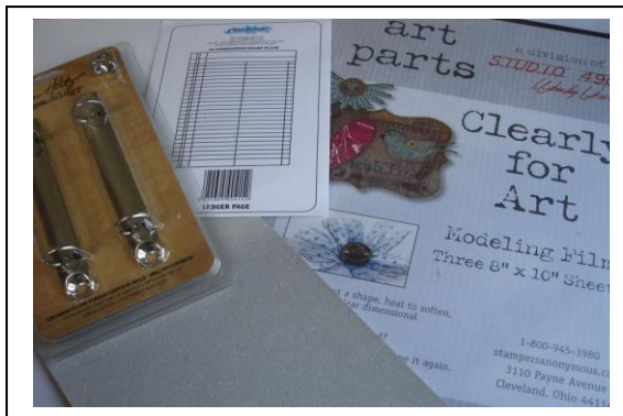
Here the clear modelling film from studio 490 has been used but the white or black film could be used depending on the results required. The grungeboard, a small ring binder & ledger A6 stamp from Creative Expressions is also need for this project.